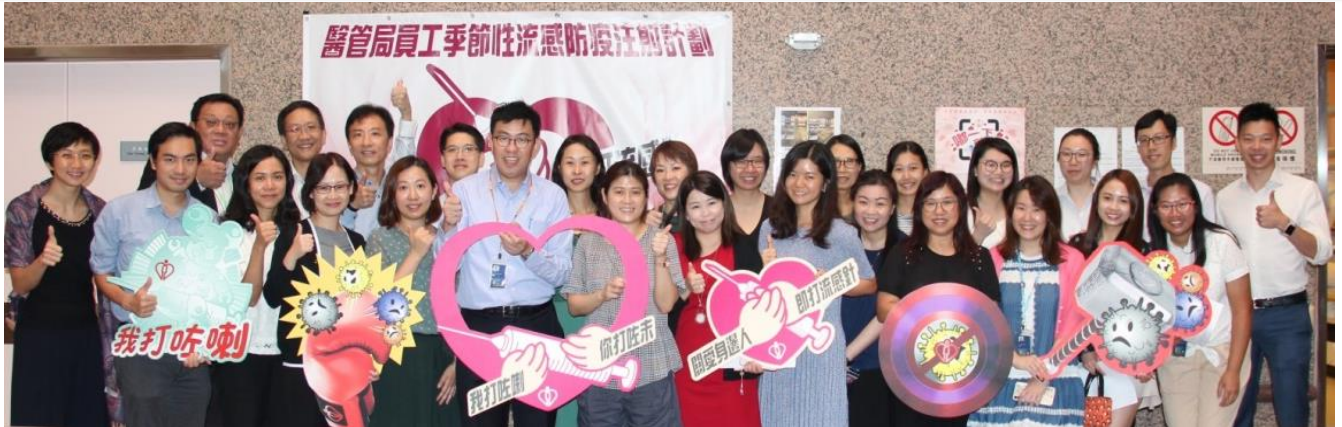
Photo 1: Group photo of members of Quality and Safety Division promoting flu jab